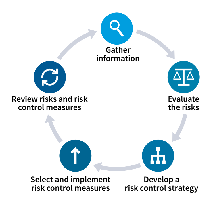
Fig. 5.1. Biosafety risk assessment framework