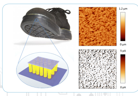
Fig. 1. (left) schematic of a possible application of nanogenerators based on nanowires. Inserted in the schoes, theycould transform the mechanical movement in electricity, for example to charge a phone, (right) topographic and current images of the nanowries array. Each single nanowire produces current densities above A/cm<sup>2</sup>

> Design of high efficiency devices such as uniform field effecct transistors, piezoelectric nanogenerators and electrodes in capacitors.